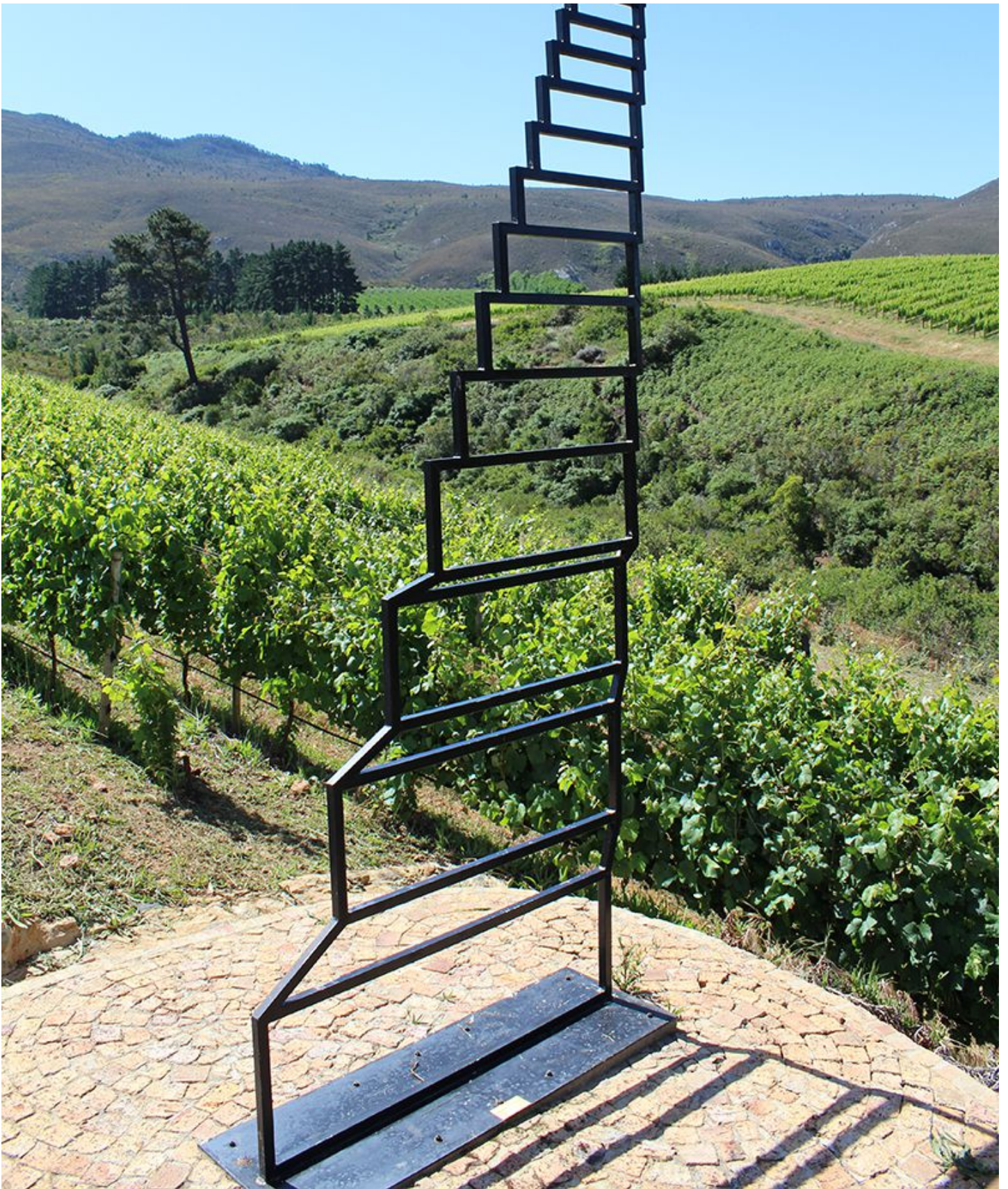
"Stairway to Heaven" - Strijdom van der Merwe