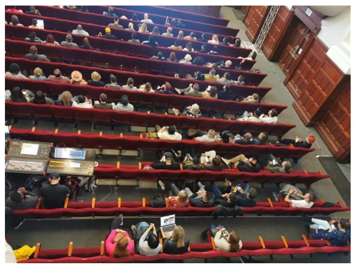
Can you spot SA's top creatives?

attention with his magenta shorts and adroitness, it's always a humbling experience to see the people who make events like Loeries possible.