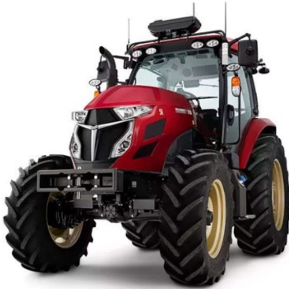
Yanmar's YT5113A robot tractor

Osaka, JAPAN - We've had autonomous cars, autonomous trucks, and autonomous buses, and now Osaka-based diesel engine manufacturer Yanmar is introducing a new line of robotic tractors.